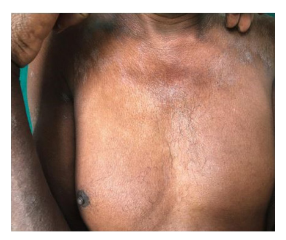
Figure 4. Casal's necklace in pellagra