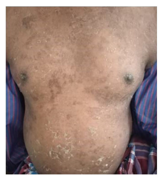
Figure 5. Loss of body hair in ADS patient