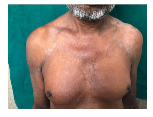
Figure 6. Gynecomastia in ADS patient